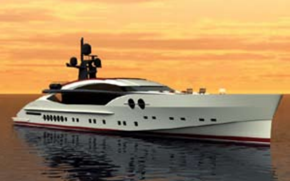
PALMER JOHNSON 170